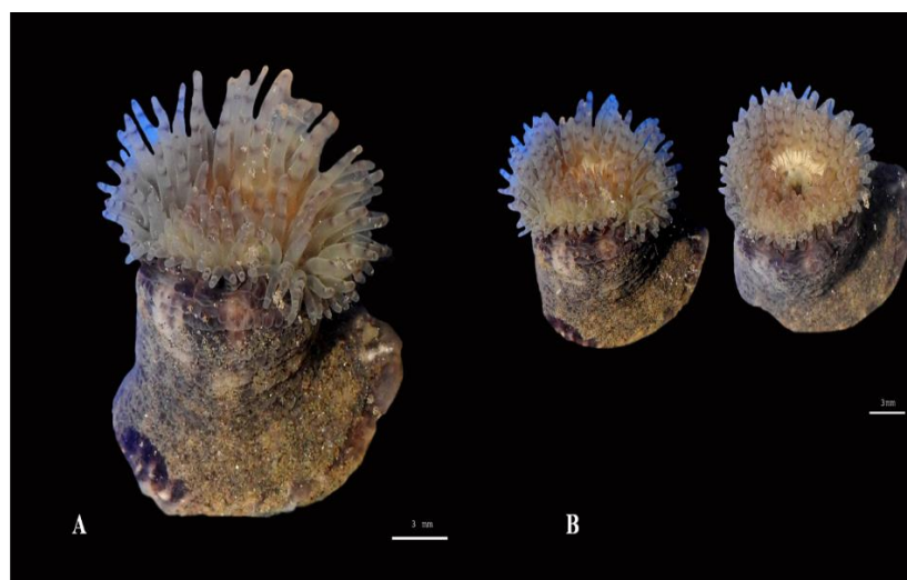
Fig. 3 (A), (B). Overall view of Anthopleura handi Dunn, 1978, (ZSI RegNo. ZSI /GNC/P4781/1) in living condition.