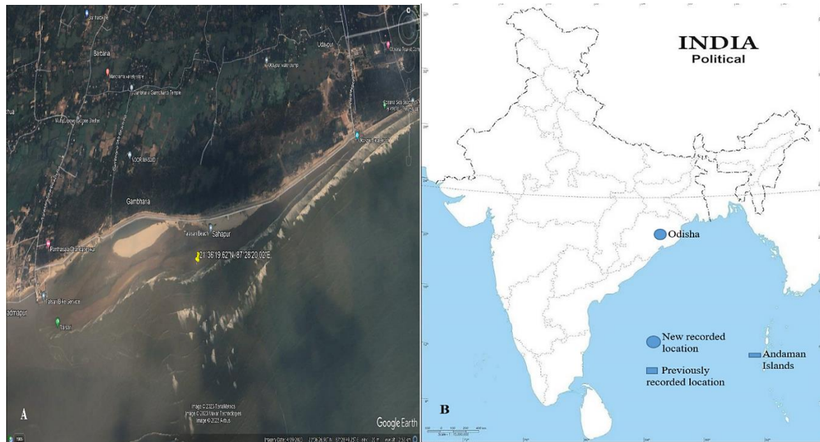
Fig. 1. (A) Sample collection site with latitude and longitude; (B) Distribution of Anthopleura handi Dunn, 1978 throughout India

morphometric analysis of the specimen was conducted. Photographs of specimens were taken in both live and preserved condition. Photograph of distinguishable characters of preserved specimens were taken under stereomicroscope, LEICA EZ4HD. Specimen was identified up to species level following the relevant literature [20,21]. Preserved specimens are deposited in the National Zoological Collections of General Non- chordate Section, Zoological Survey of India, Kolkata, India.