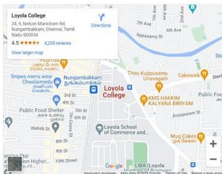
Fig. 1. Geographical location of Loyola College, Chennai

The field guide book written by Foottit et al. 2009 is titled " Insect Biodiversity: Science and Society " [5]. It is a comprehensive guidebook that provides an overview of the science of insect biodiversity, including the many different types of insects, their ecology, and their role in society. The book covers a wide range of topics related to insect biodiversity, including insect classification, insect conservation, and the impact of insects on human societies. It is intended for researchers, students, and anyone interested in learning more about insects and their importance in our world.