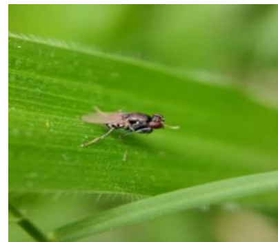
Fig. 29. Mantid Shoeflies