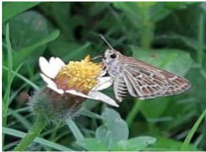
Fig. 2. Common grass dart