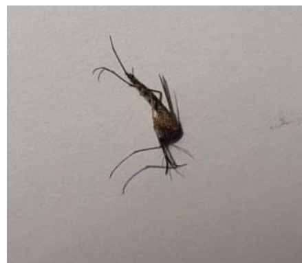
Fig. 33. Dark ricefield Mosquito