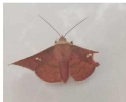
Fig. 25. Sapodilla moth