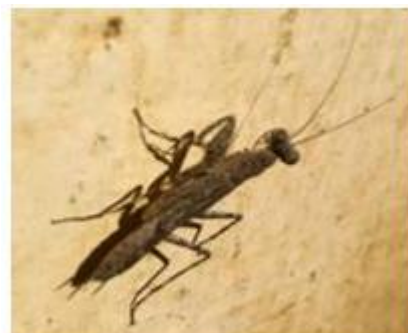
Fig. 63. Bark Mantis