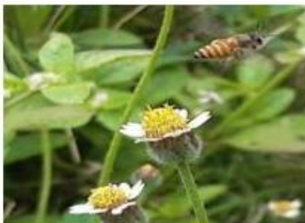
Fig. 48 Indian Honey Bee