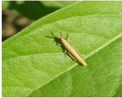
Fig. 58 Painted Grasshopper