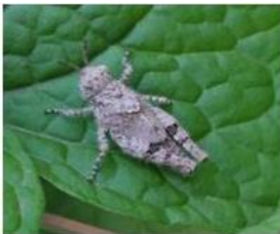
Fig. 62. Chrotogonus