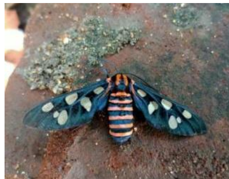
Fig. 21. Sandalwood defoliator