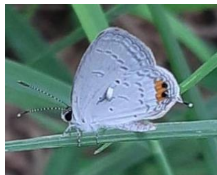
Fig. 17. Gram Blue