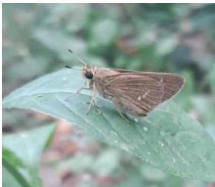
Fig. 6. Oriental straight swift