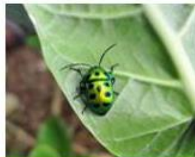
Fig. 39. Jewel Bugs