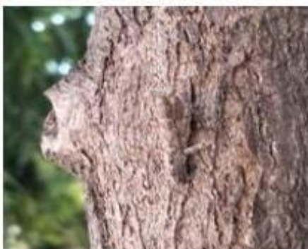
Fig. 64 Mayan Lichen Mantis