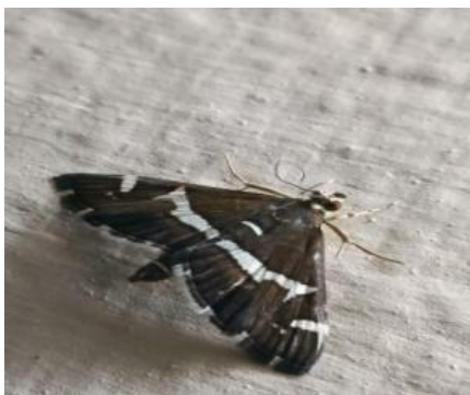
Fig. 4. Beet webworm moth