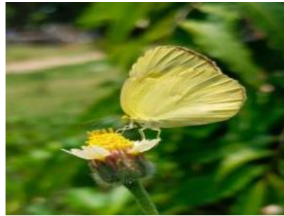
Fig. 3. Lemon migrant