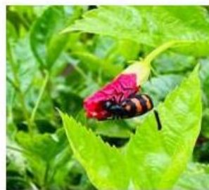
Fig. 71 Blister Beetle