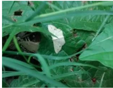
Fig. 19. Small Broom