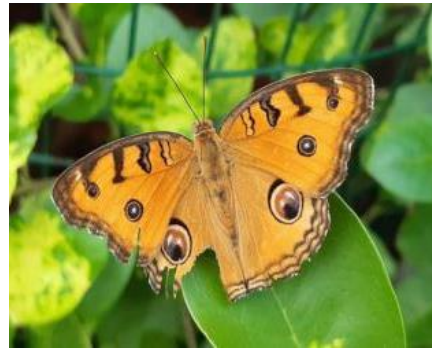
Fig. 11. Peacock pancy