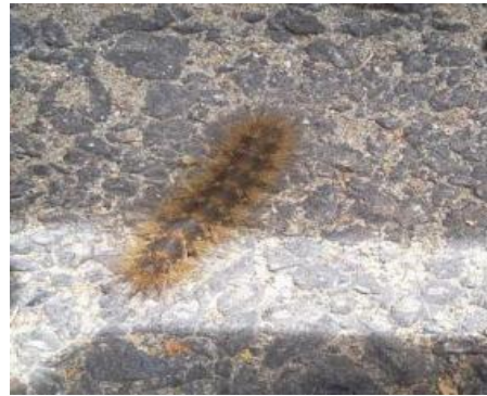
Fig. 27. Caterpillar