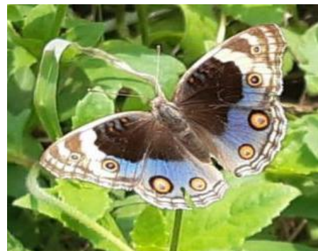
Fig. 23. Blue Pansy