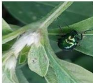
Fig. 70 Leaf Beetles