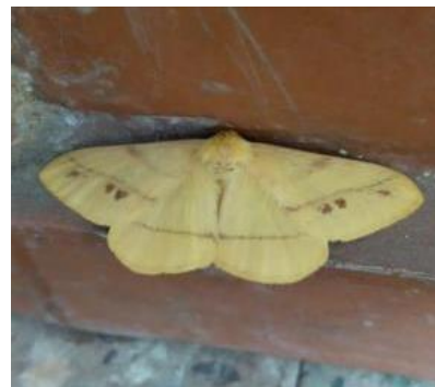
Fig. 13. Monkey moth eupterote sp.