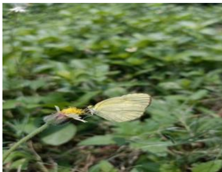
Fig. 12. Mottled emigrant