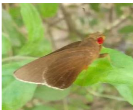
Fig. 24. Common Red Branded Eye