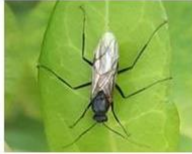
Fig. 51 Japanese Carpenter Ant