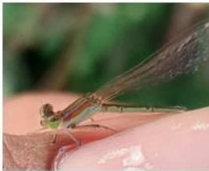
Fig. 52 Damselfly