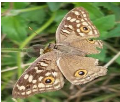
Fig. 22. Lemon Pansy