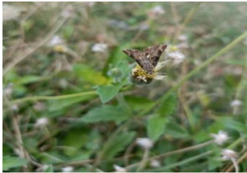
Fig. 10. African marbled skipper