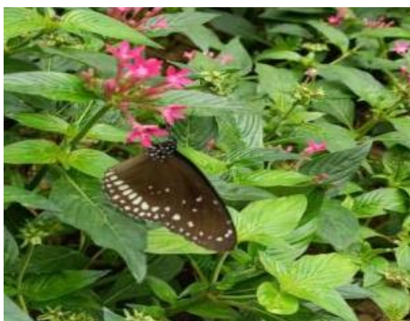
Fig. 8. Common crow