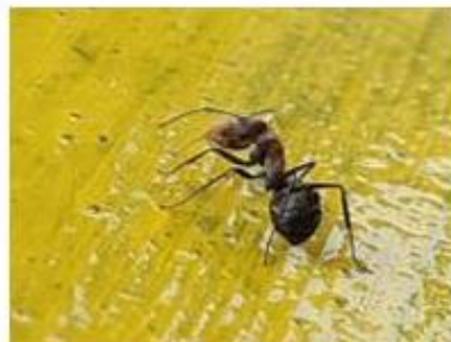
Fig. 49 Carpenter ant