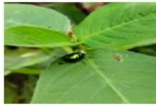
Fig. 67 Leaf beetles