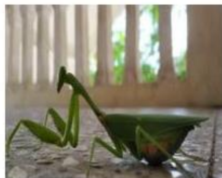
Fig. 65 Thorny armed mantis