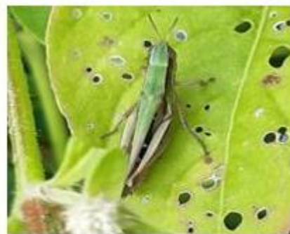
Fig. 61 Wingless grasshopper