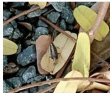
Fig. 73 Lobe winged cockroach