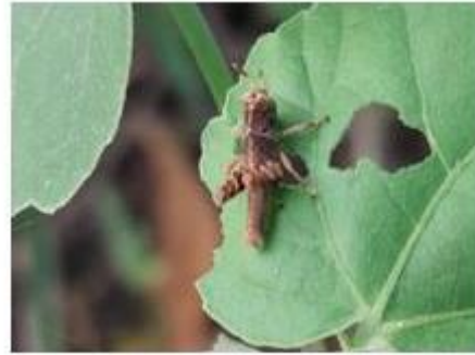
Fig. 59 Short horned Grasshopper