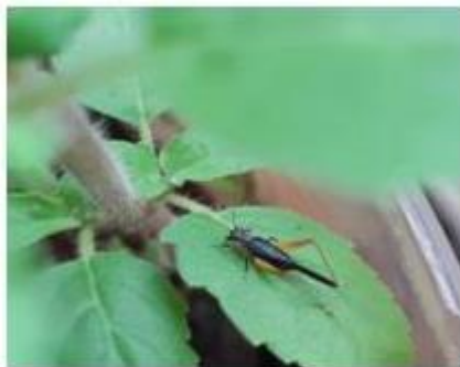
Fig. 60 Common trig