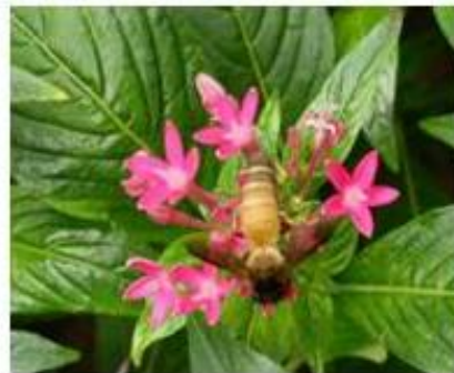
Fig. 47 Giant honey bee