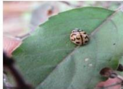
Fig. 55. Ladybird beetle