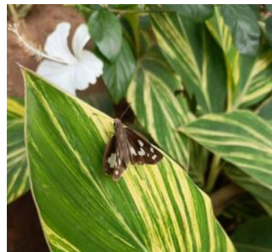
Fig. 7. Grass demon