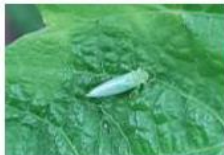
Fig. 41. Eggplant horned planthopper