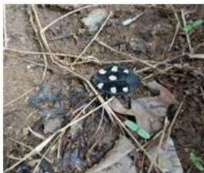
Fig. 74 Indian Domino Cockroach