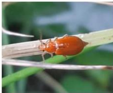
Fig. 72 Curcubit Beetle