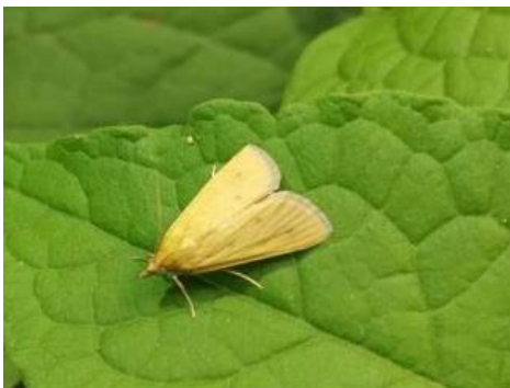
Fig. 20. Bean leaf Webworm