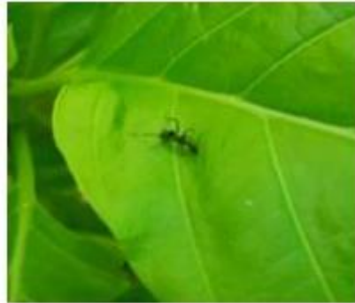
Fig. 43. Longhorn Crazyant