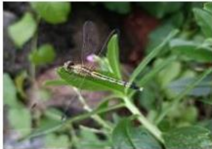
Fig. 54. Chalky percher