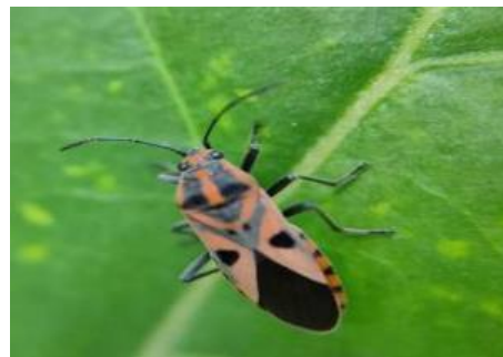
Fig. 37. Darth Maul bug