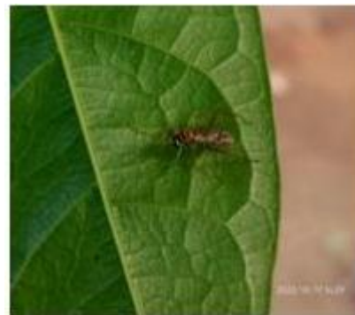
Fig. 45. Setanta Compta