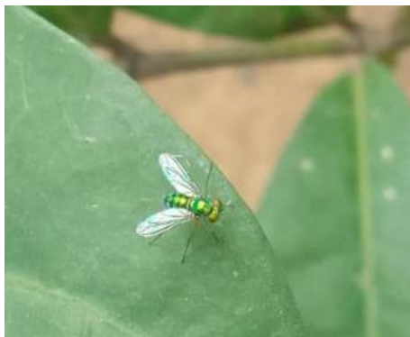
Fig. 30. Longlegged flies