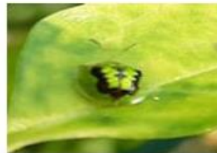
Fig. 69 Green tortoise beetle