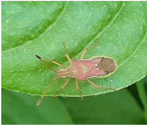
Fig. 34. Slender rice bug