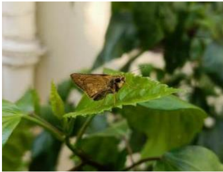
Fig. 18. Dark Palm Dart