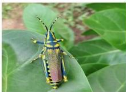
Fig. 56 Grasshopper