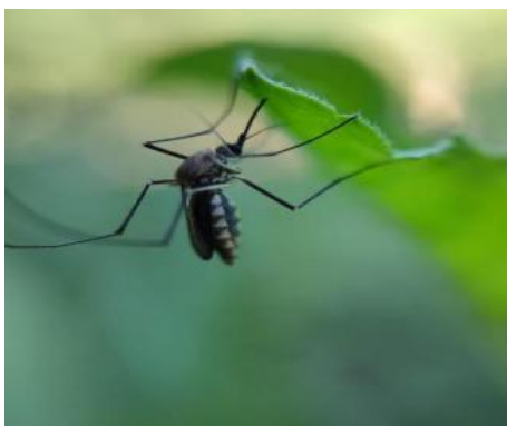
Fig. 32. Culicine Mosquito