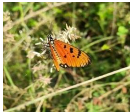
Fig. 5. Tawny coaster