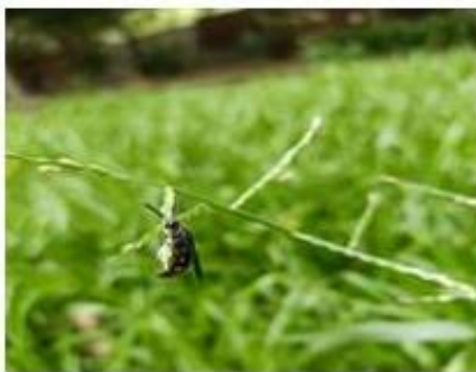
Fig. 46 Scolia guttata wasp