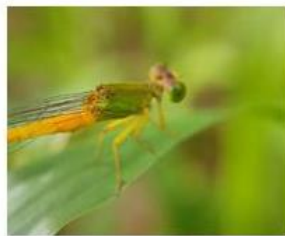
Fig. 53 Orange marsh Dart