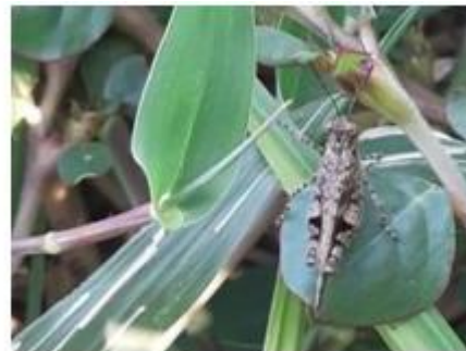
Fig. 57 Band Winged Grasshopper