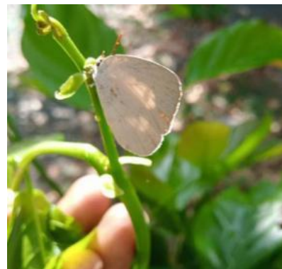
Fig. 15. Indian Sunbeam