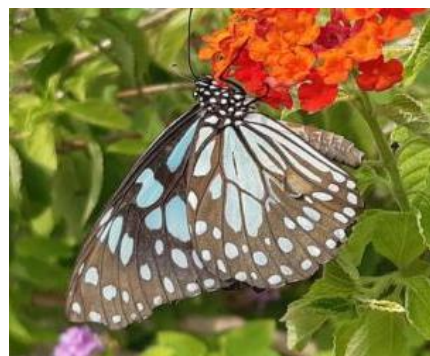
Fig. 9. Blue tiger