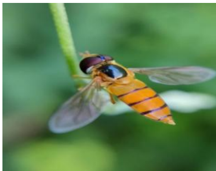
Fig. 28. Orange striped Hover Fly