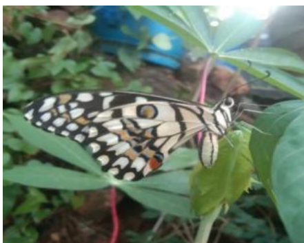
Fig. 16. Common Swallow tail