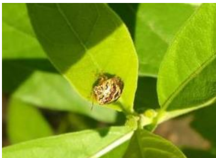
Fig. 36. Stink bug