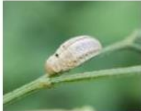
Fig. 68 Sunflower beetle