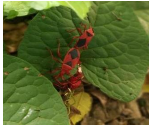
Fig. 35. Indian Red Bug