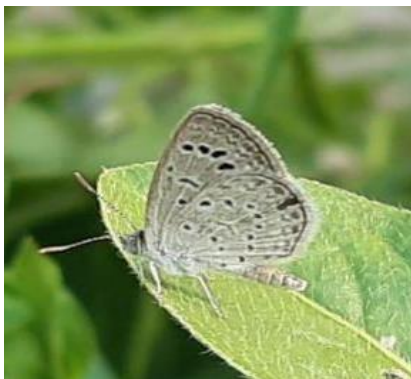
Fig. 14. Lime blue