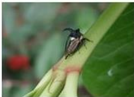
Fig. 40. Common green leaf hopper