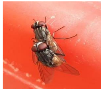
Fig. 31. Common Housefly