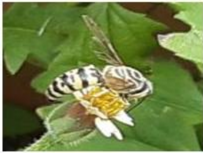
Fig. 50 Oriental hornet