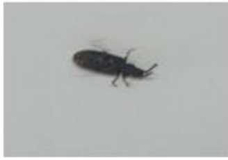
Fig. 66 Pine flower weevils