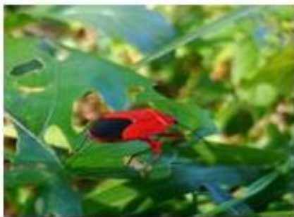
Fig. 38. True Bugs