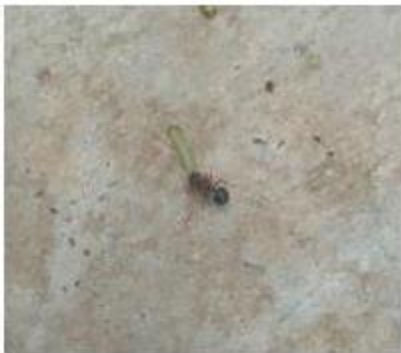
Fig. 44. Bicolored shield ant