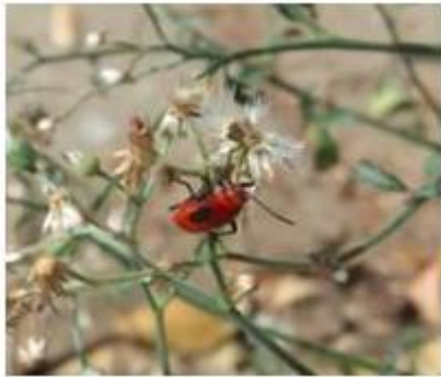
Fig. 42. Red bug