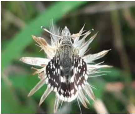
Fig. 26. Grizzled skippers